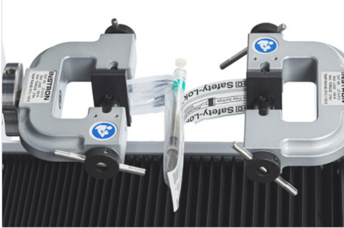
Figure 2. Image of Universal Testing Machine grips from Instron®. https://www.instron.com

The tester records the force (in Newtons) being applied across a range of peel displacement. The average force across a defined range of peel displacements is used as a single data value summarizing a test. Figure 3 shows this for 3 specimens.